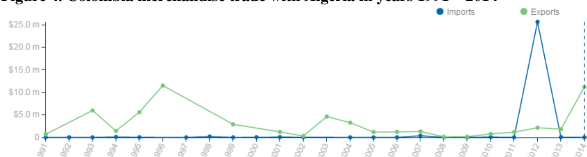
Figure 4. Colombia merchandise trade with Algeria in years 1991 – 2014

In the case of trade relations between Colombia and Algeria, trade in goods shows many variations in exports from Colombia to Algeria from 1991 to 2008, presenting a positive trade balance for Colombia. In the years 2008, 2009 and 2010, exports fell to zero and returned again moderately in 2011-2014 as shown in Figure 4. With regard to imports from Algeria to Colombia can be seen that were null until 2012 which mainly imports mineral oils and distillation products are reported.