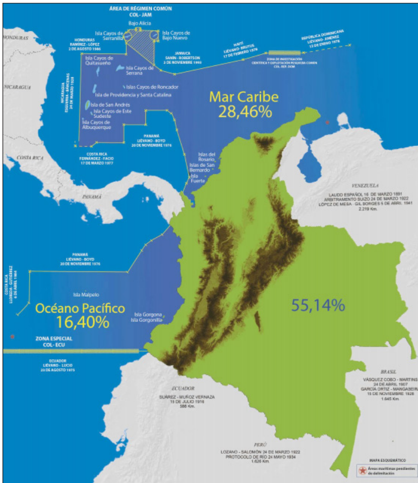
Figure 3. Colombian Maritime and terrestrial areas