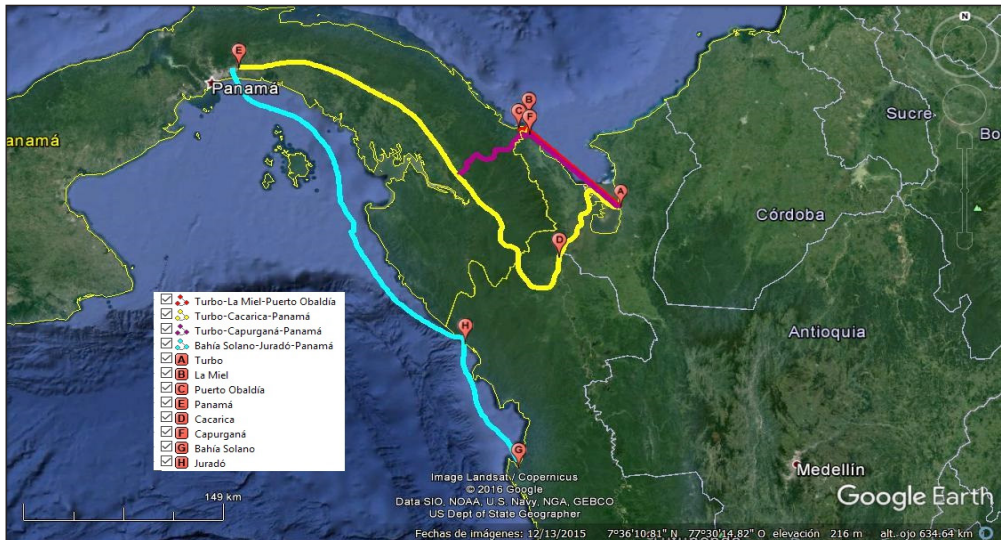
Figure 6. Illegal migration routes in the Darien region.