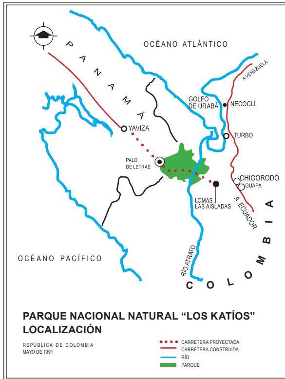
Figure 7. Pan-American Highway in the Darien region