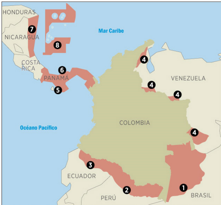
Figure 1. Territories granted by the Republic of Colombia