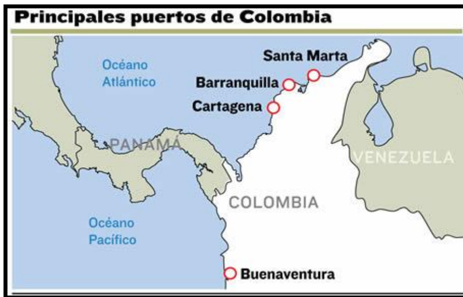
Figure 1. Main Ports of Colombia