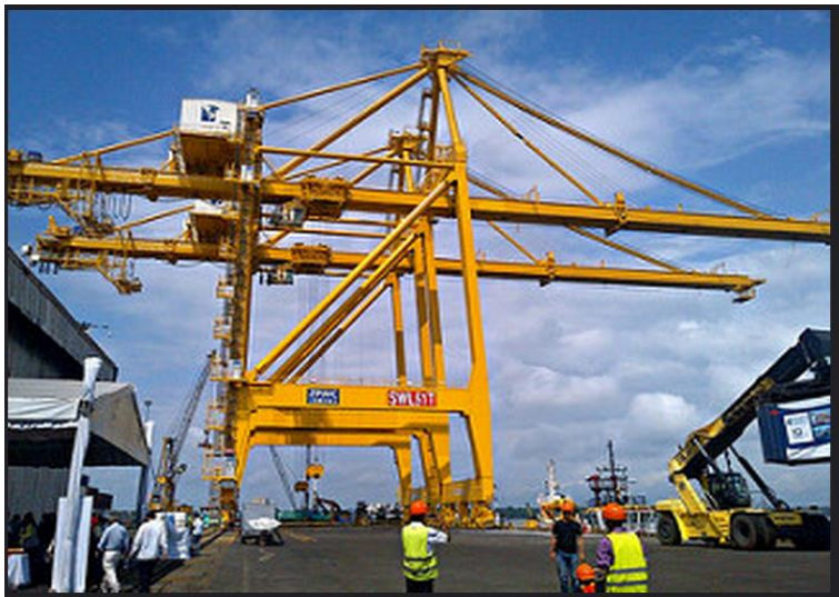
Figure 4. Post Panamax gantry crane