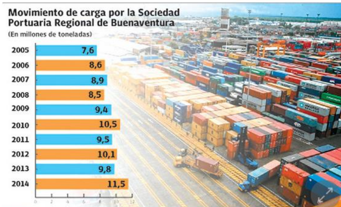
Figure 3. Cargo movement by the Regional Port Society of Buenaventura