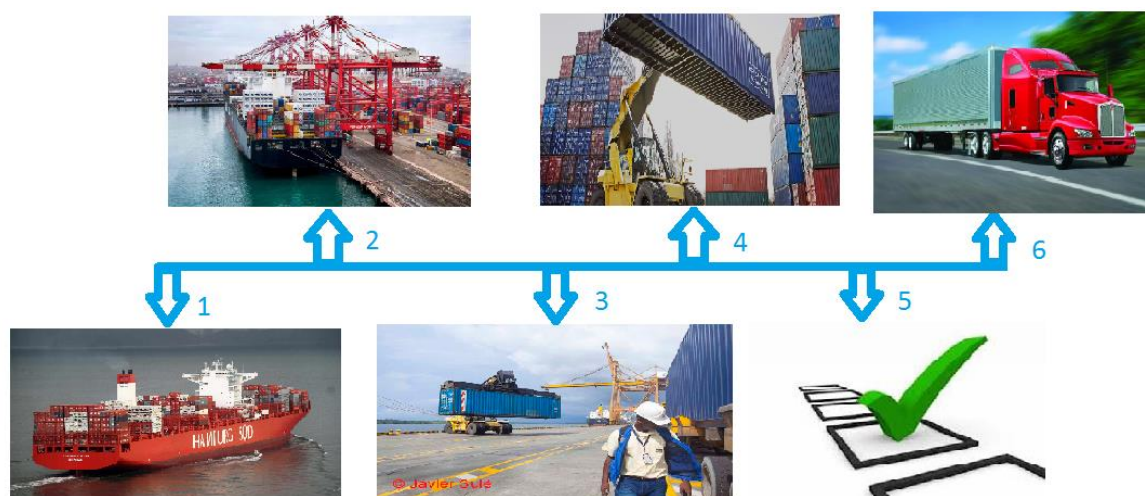
Figure7. Port Logistics Process To Nationalization of goods in Buenaventura