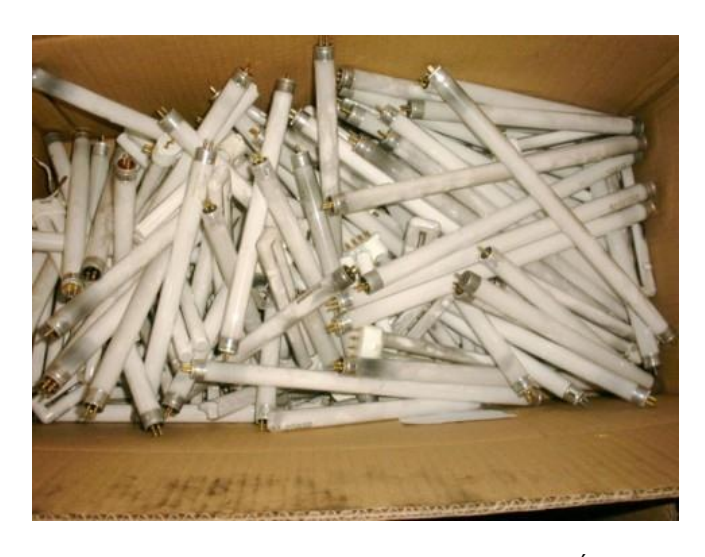
FIGURE 3. RESPEL of luminaires.

LOS RESIDUOS DE APARATOS ELÉCTRICOS Y ELECTRÓNICOS (MacGibbon, 2011)