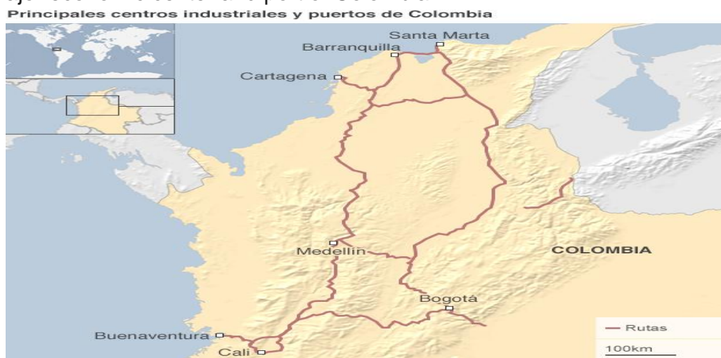
Figure 1.4. Major economic center and port of Colombia

(Wwww.BBC.com, Why it is three times cheaper to send a container from China).