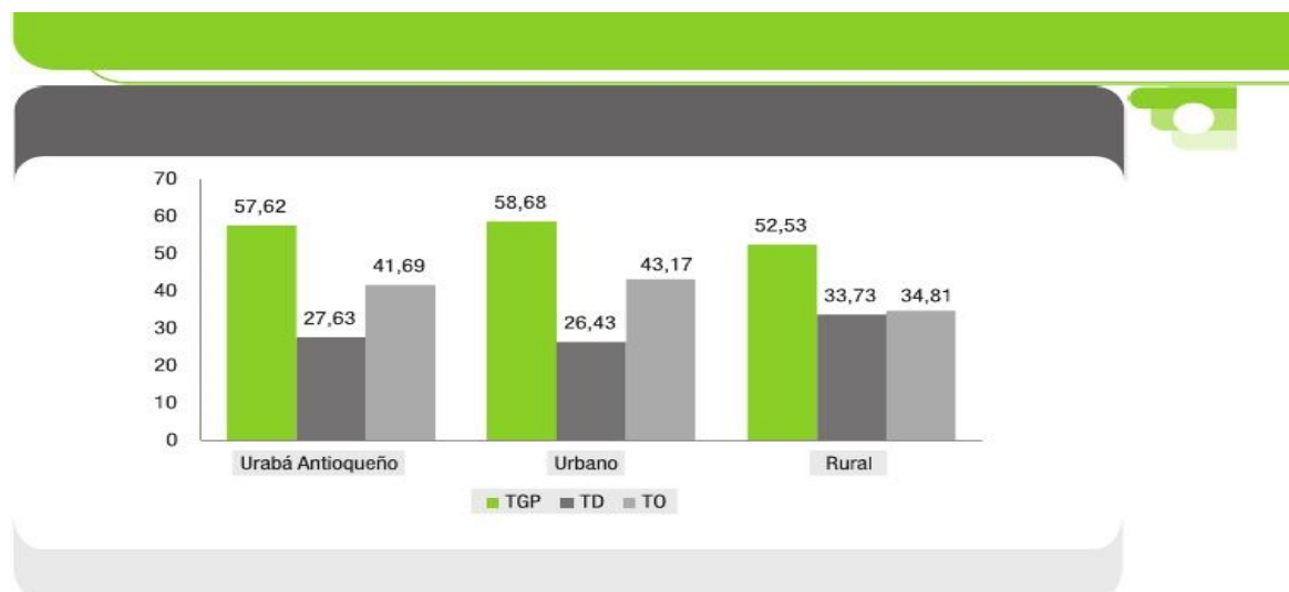
Figure 1.6. population distribution according to labor demand location.

(Www.academia.edu, Characterization of labor demand in four municipalities of Uraba).