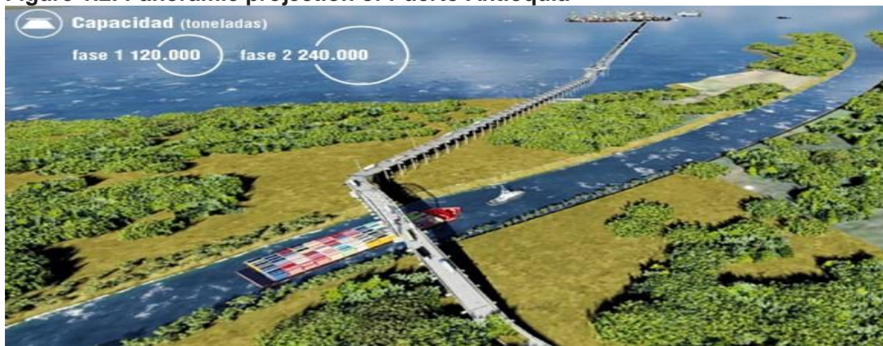
Figure 1.2. Panoramic projection of Puerto Antioquia

( Http://antioquia.gov.co/uraba/index.php/blog/225-puerto-antioquia-es-una-realidad ).