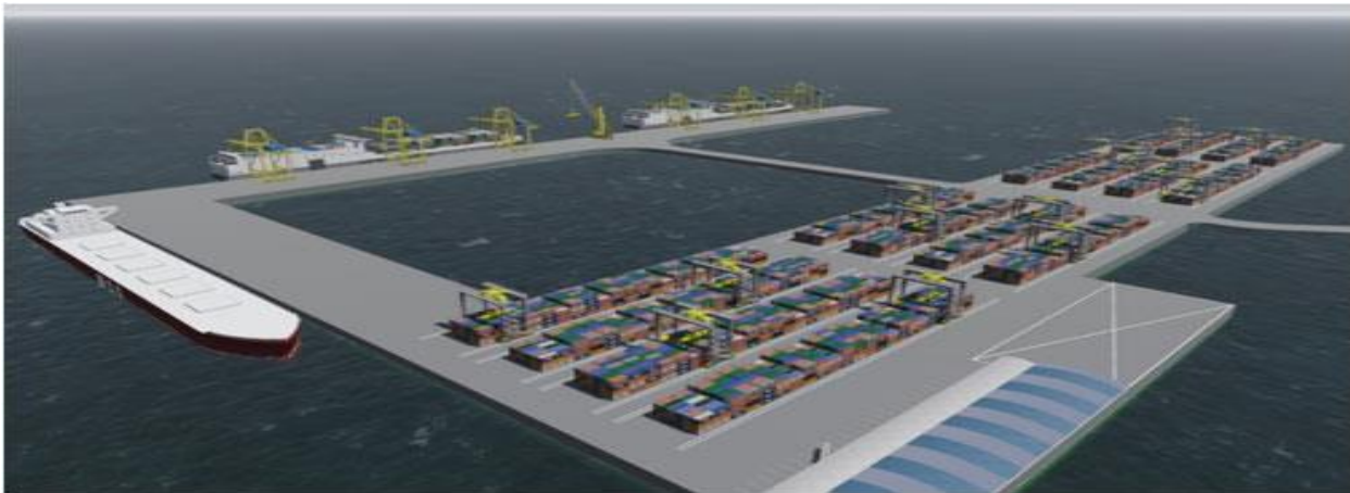
Figure 1.1. Puerto Antioquia is a reality

( Http://antioquia.gov.co/uraba/index.php/blog/225-puerto-antioquia-es-una-realidad ).