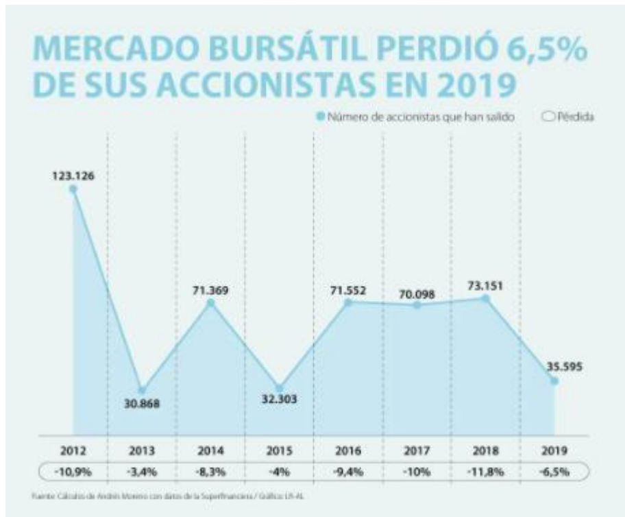
Figure 1: Colombian Stock Market.

The following graph shows how Colombia has lost shareholders during the period 2012-2019.