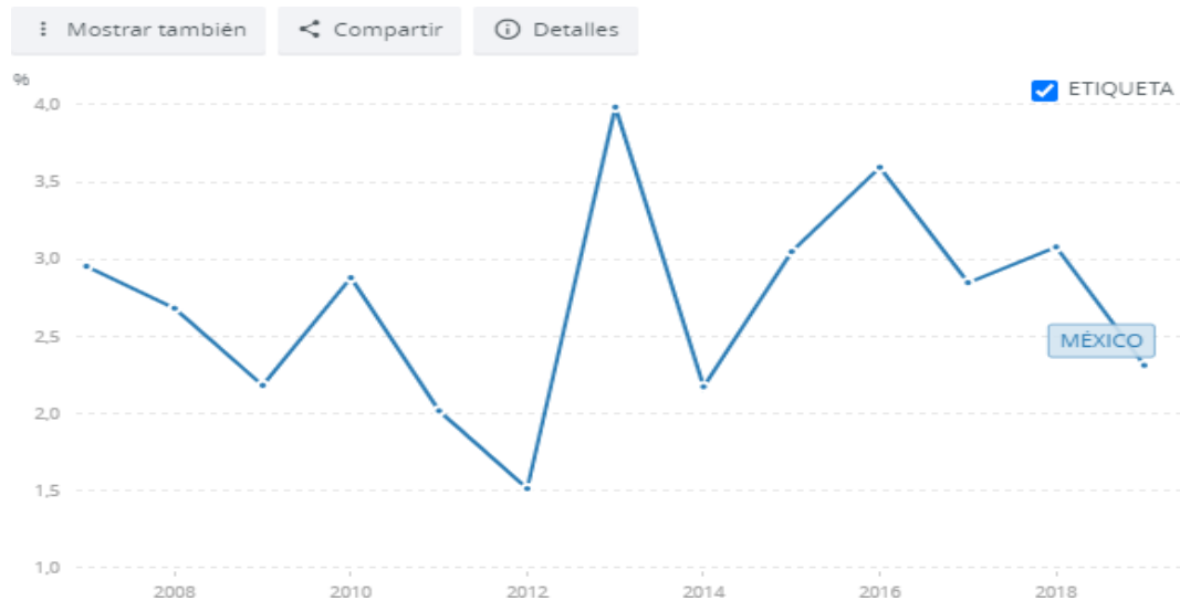
Figure 2: Foreign Direct Investment Mexico.

The graph shows the behavior of foreign investments in Mexico from 2007 - 2019.