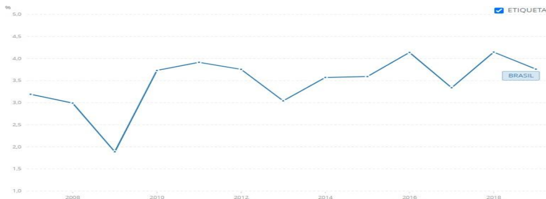
Figure 4: Foreign Direct Investment Brazil.

The graph below shows Brazil's foreign direct investment during the period 2008-2019.